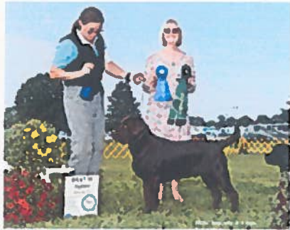
Best Puppy, JSLRC Specialty, 8 mos.