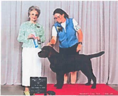
Best Puppy, NBKC, Canada, 7 mos. old